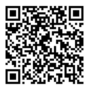
Scan to Apply